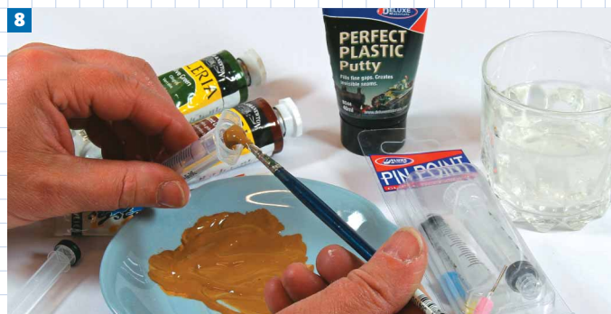
Then fill a Deluxe Materials Pin-Point Syringe and select an appropriate tip