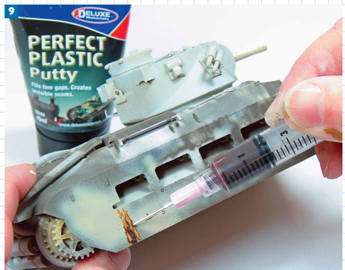
This can then be applied to the model for where more direct mud is required, as on or around the tracks and wheels. A splattered mud effect can be achieved by dipping an old toothbrush or other stiff brush into the mixture and then running a thumb along the bristles, so that the mixture is flicked onto the area required