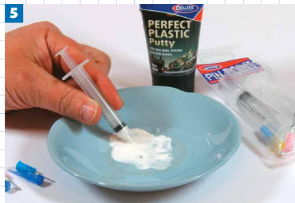
Weld seams, rivets and tunic buttons can be easily created. Find a suitable receptacle and mix some Perfect Plastic Putty with a small amount of water to a smooth paste. Fill a small syringe with the thinned Perfect Plastic Putty and select an appropriate tip