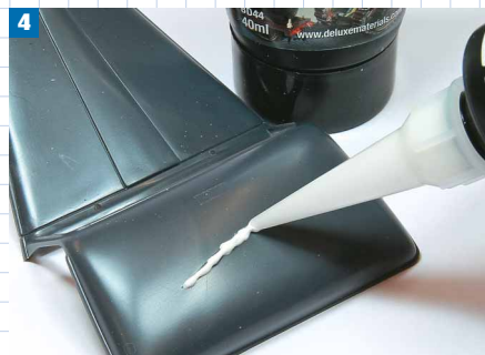
Scratch and dent repairs can be easily achieved using Perfect Plastic Putty