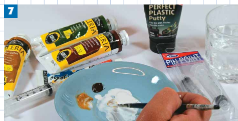
For mud effects simply mix Perfect Plastic Putty with a small amount of water-based paint and water until a smooth paste is achieved