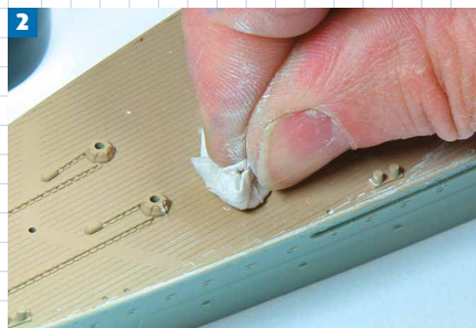
Use a damp cloth or moist finger to wipe away any excess