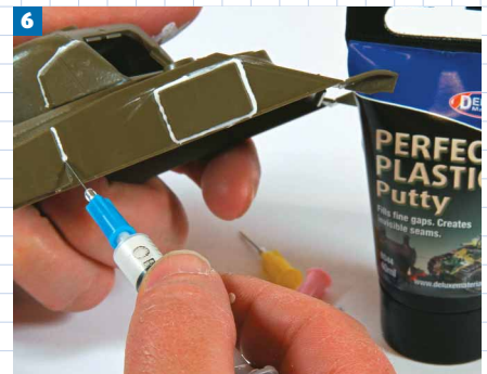
Apply the putty in a thin bead as required, and once dry the putty can be filed for extra effects