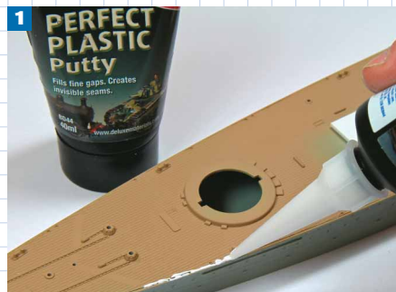
With a nozzle attached, apply the Perfect Plastic Putty into the area to be filled

areas, for repairing scratches, for simulating weld seams and creating other surface details often missing on mouldings. It can also be diluted with water and coloured to simulate other effects. For fine scale work I have found that Perfect Plastic Putty can be dispensed easily using Deluxe Materials' Pin-Point Syringe kit .